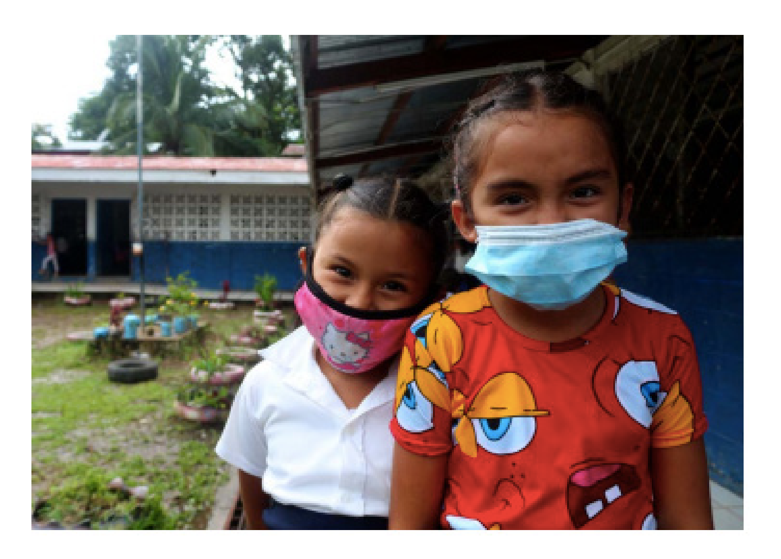
Do not neglect to do good and to share what you have