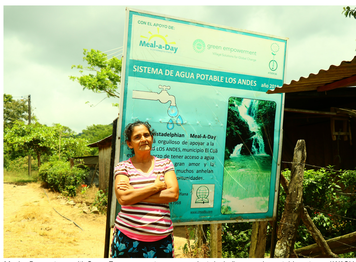
Meal-a-Day partners with Green Empowerment on many projects including ensuring potable water and WASH (Water, Sanitation and Hygiene) training.