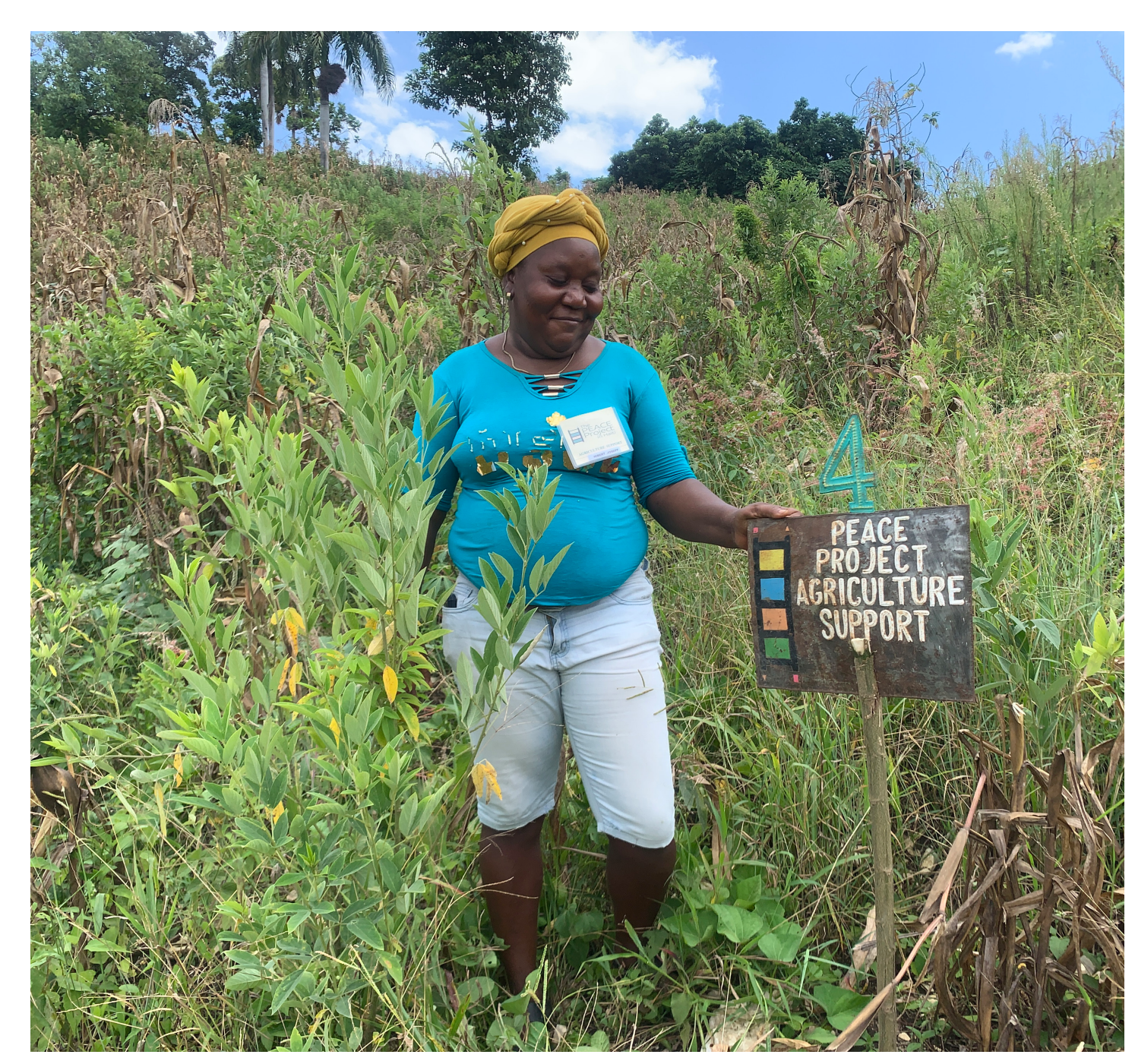
Meal a Day is supporting an Agricultural Support project first begun and now administered by PEACE Project of Haiti. 70 farmers in the rural Carrefour area are getting advice and instruction as well as good seed and fertilizer from a certified agronomist. The idea is to help them produce more and better food for their tables and to sell at the market.