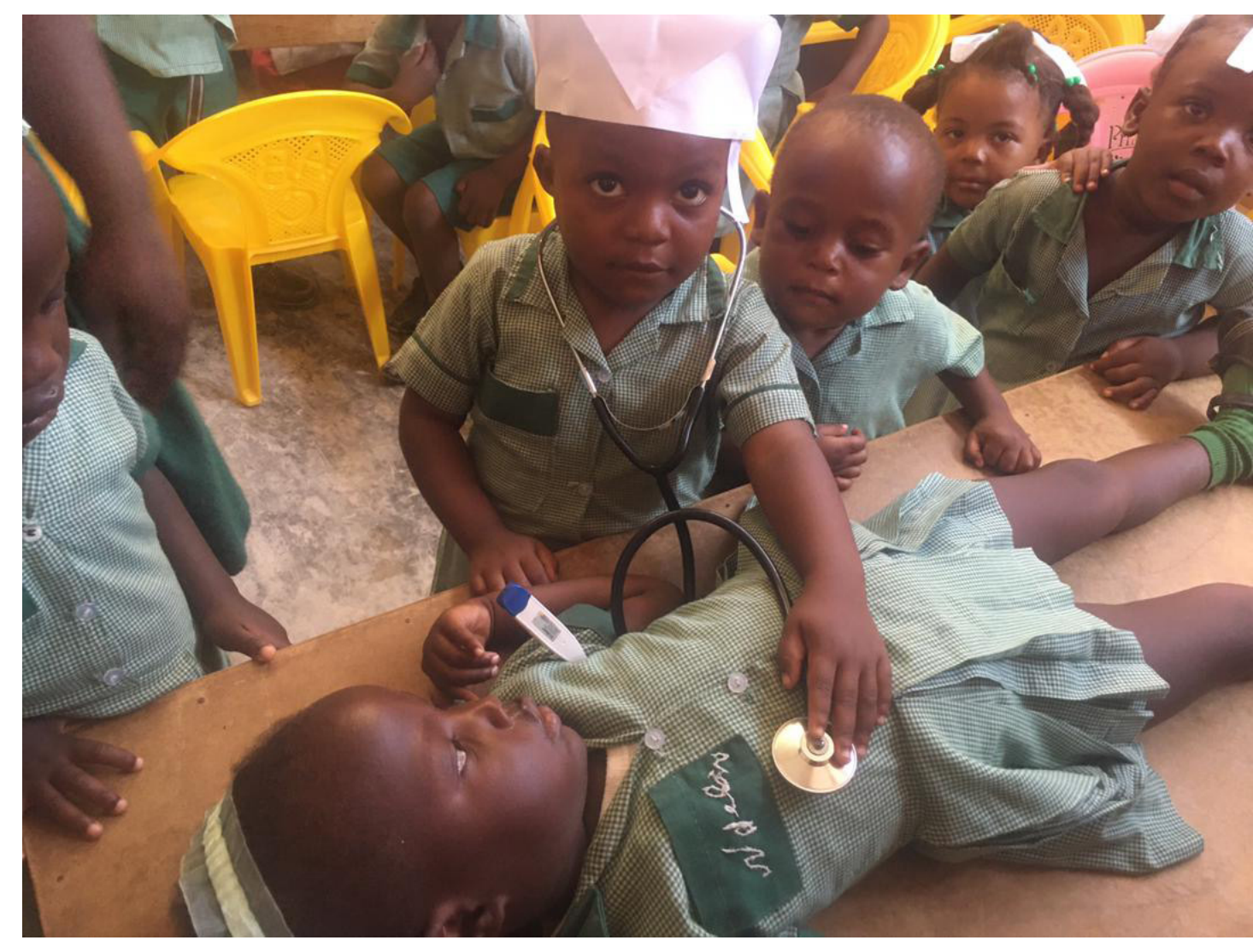
Kindergarten starts at age 4 with three levels (ages 4, 5, and 6).