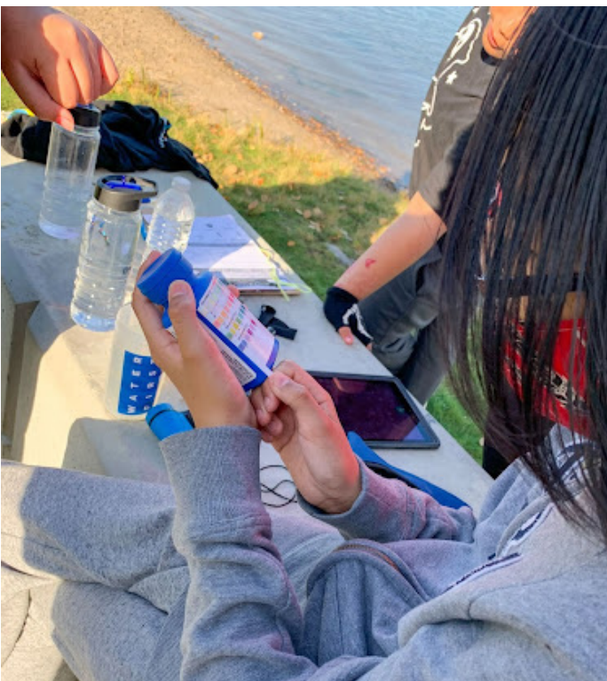
Indigenous students learn about hydrology and watershed ecology while further developing their relationship with water and their lands in Northern Ontario.