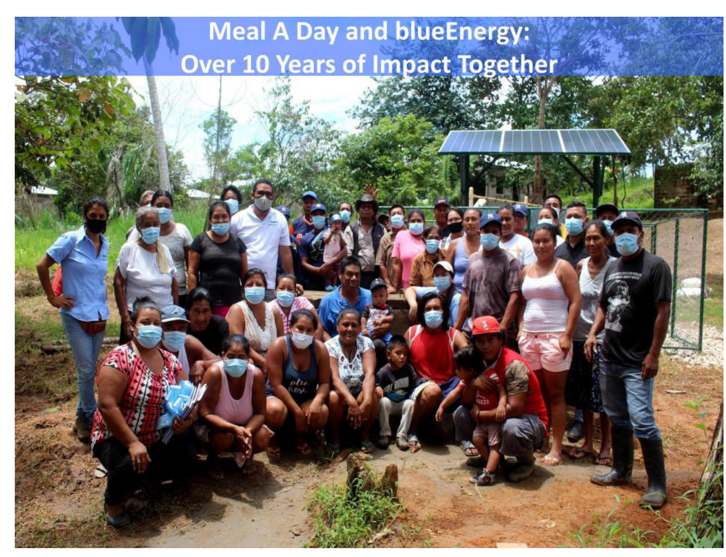
Meal-a-Day partners with Blue Energy on many projects including providing safe drink water to many communities.