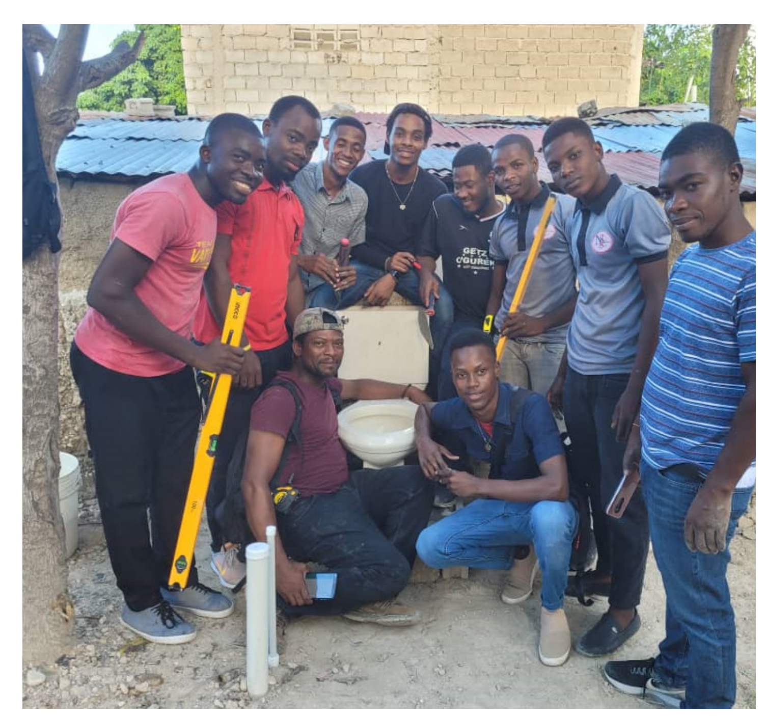
Meal a Day launched this vocational school 6 months ago. 125 plus students learning trades.