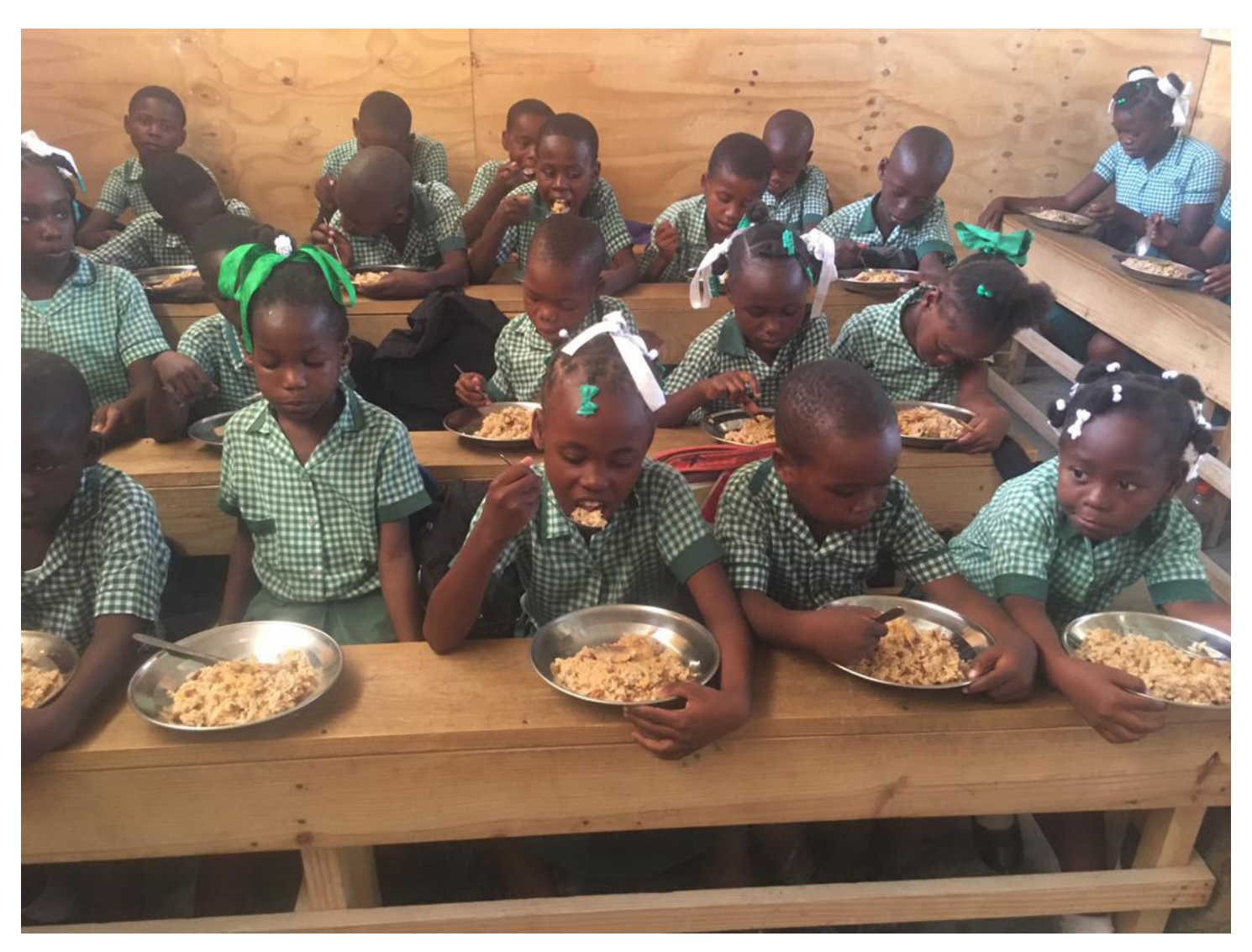
Meal-a-Day serves a Meal a day to over 500 children at the three schools it supports.