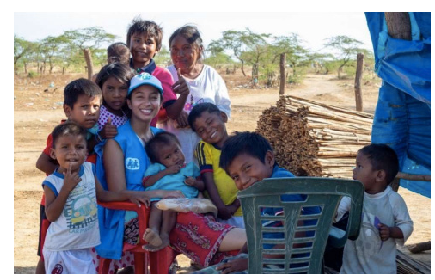
An SOS staff visiting a family whose children participate in the Child-Friendly Space.